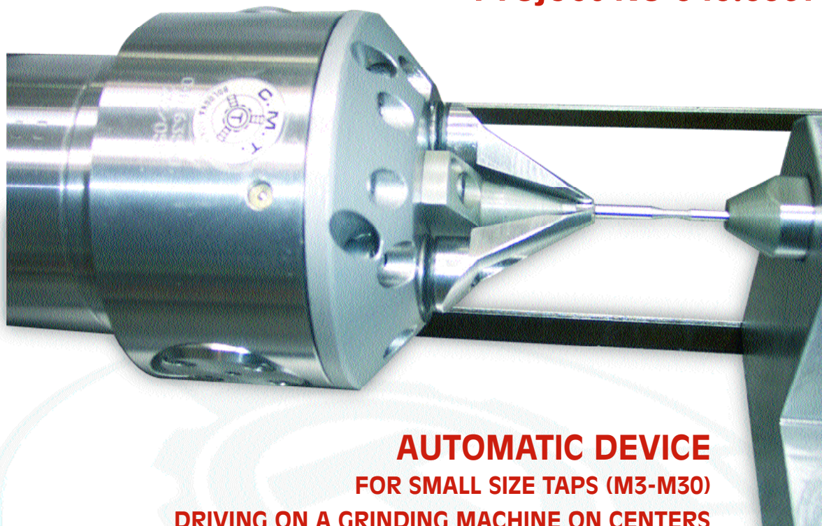
AUTOMATIC DEVICE FOR SMALL SIZE TAPS (M3-M30) DRIVING ON A GRINDING MACHINE ON CENTERS